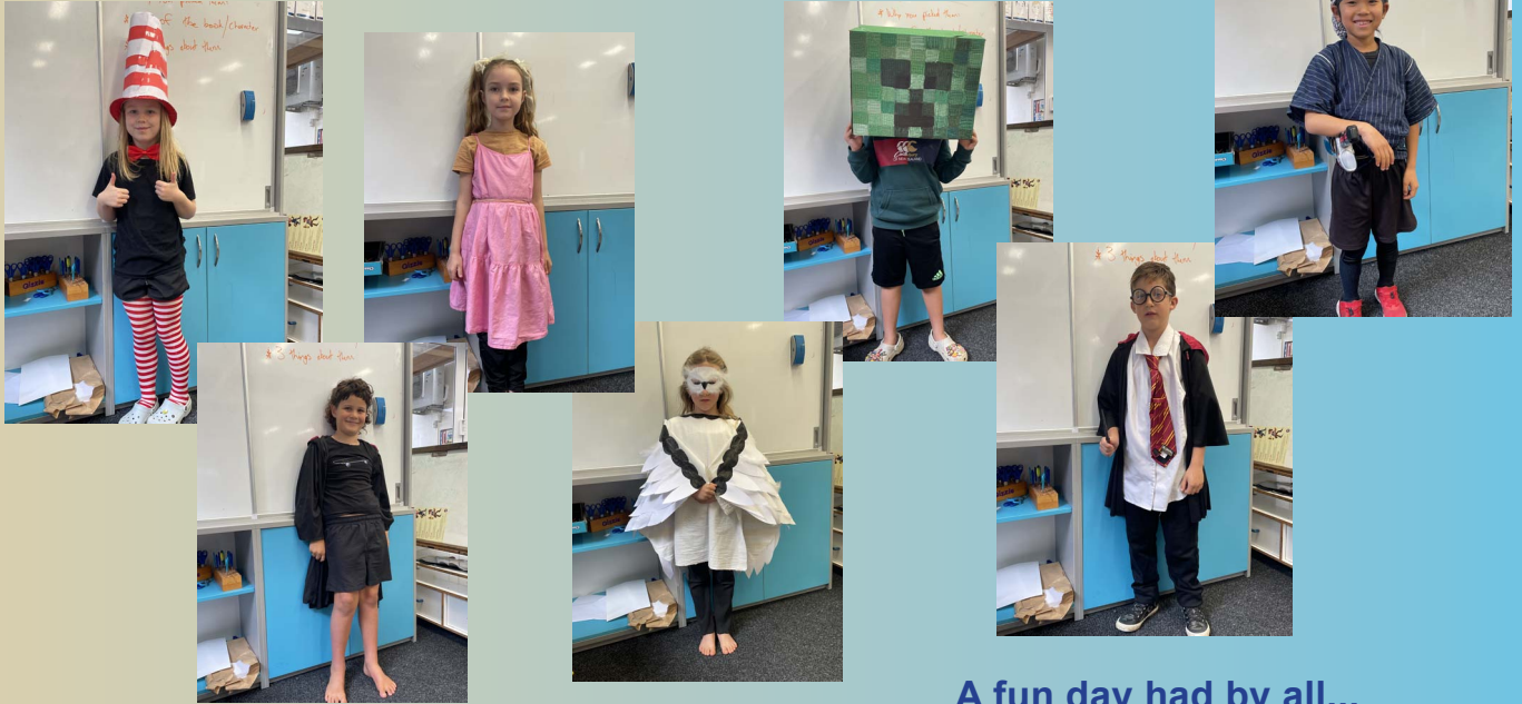
A fun day had by all...