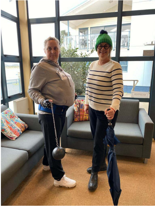
... even Ms Trunchball and Wally turned up!

Email: hello@mykindo.co.nz Online support: support.mykindo.co.nz